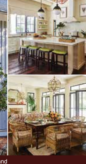
Exclusive Builder, Southern Living Inspired Community at Cape Fear Station on Bald Head Island